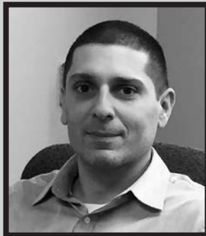
Each month, Staff Spotlight will highlight a LaFayette Central School District employee.