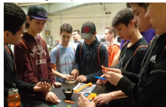
Examining various designs that were 3D Printed by Syracuse University engineering students.