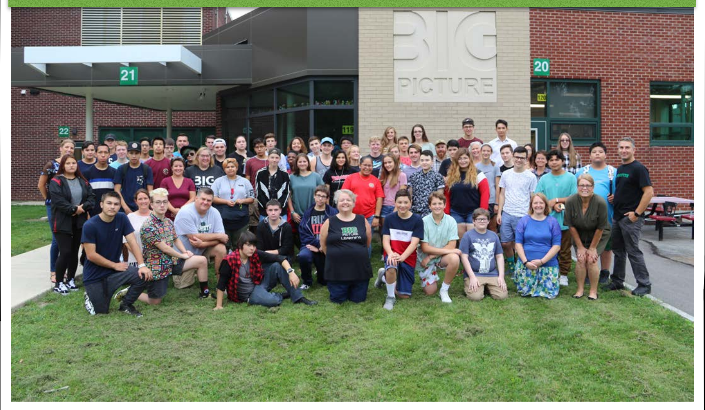
We are PRESENT . We are POSITIVE . We are PASSIONATE .

We had a great week leading up to our break. It included stressors and high emotitions, but we were able to keep it together! On Tuesday, students not at internships sites participated in one of our favorite service learning opportunities: Distribution Day. Our group helped to sort and assemble holiday gift bags for children and families in need. The organizers paid our group some wonderful complements on behavior and work ethic. (My early holiday present!) We were able to spend Friday enjoying each other and participated in our annual Reindeer Games. The Reindeer Games included our Door Decorating Contest, Candy Wreaths being delivered with a singing message, Gourmet Hot Chocolate, Holiday Movies, card making, 1980 bead crafts (Friendship Pins.....remember those!), a puzzle, candy cane ornaments, and many more activities. We competed as advisories in eating donuts off a string, making toliet paper snowmen, snowball catapults, reindeer antlers, and snowball chow down. We finished our celebratory Friday with a karoke battle like none other. Students commented on how fun the day was and I saw many positive interactions between and among students. It was the perfect end to December. When we return from break, we have a focus of internship attainment, completion on new learning plans, and preparing for the January Regents exams.