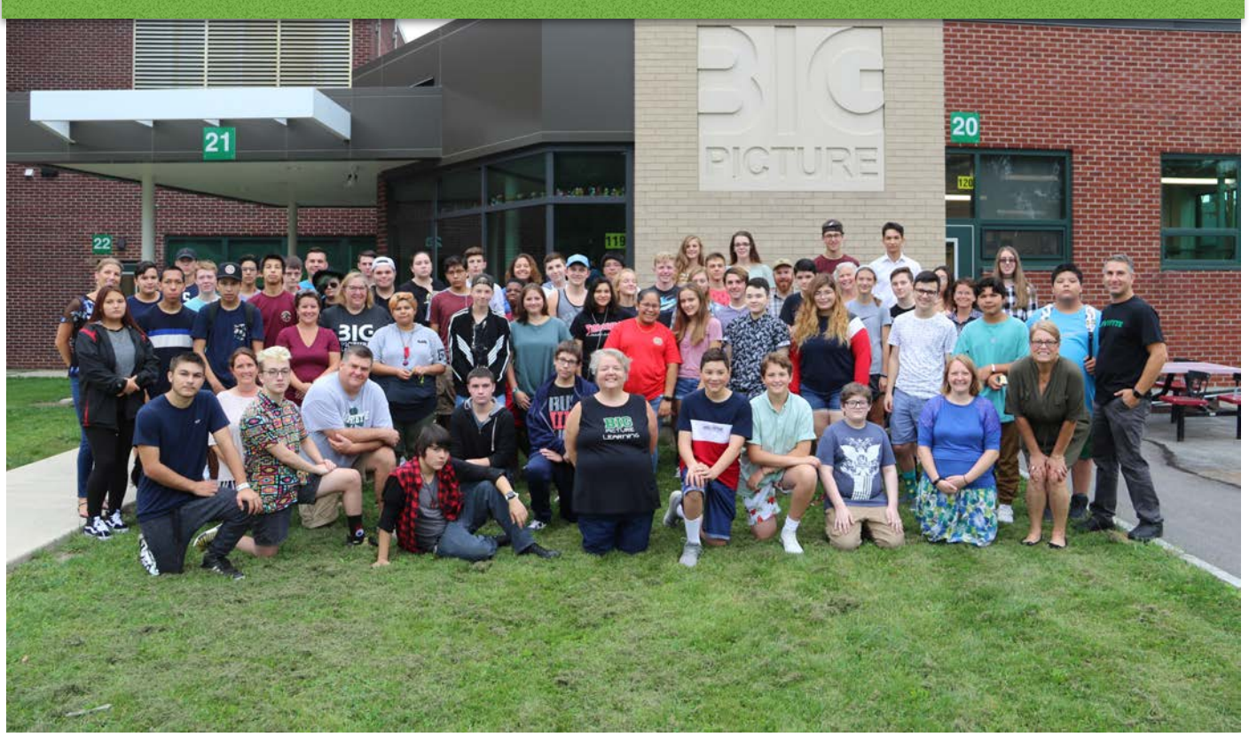
We are PRESENT . We are POSITIVE . We are PASSIONATE .

This was a short week for me as I traveled with my daughter to two figure skating competitions Thursday through Sunday. I covered many miles and was able to observe determination, focus, disappointment and success displayed by my daughter and hundreds of other skaters. The skaters were able to take risks some which lead to rewards of a medal and other risks that led to defeat.