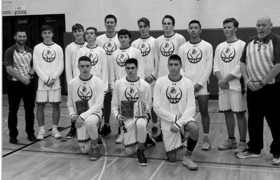
Varsity Boys Basketball

Congratulations to the following teams who had players that were Scholar Athletes: