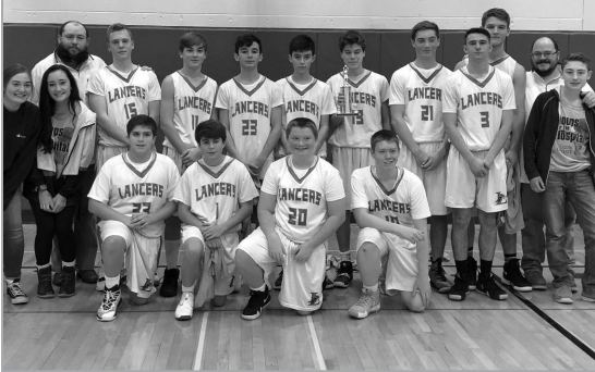
JV Boys Basketball

Congratulations to the JV Boys Basketball team on winning the Lancers vs. Cancer Basketball Tournament.