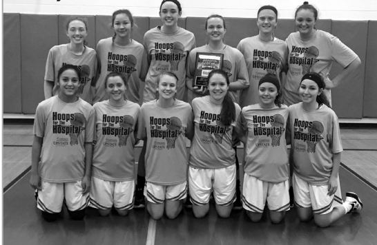
Varsity Girls Basketball