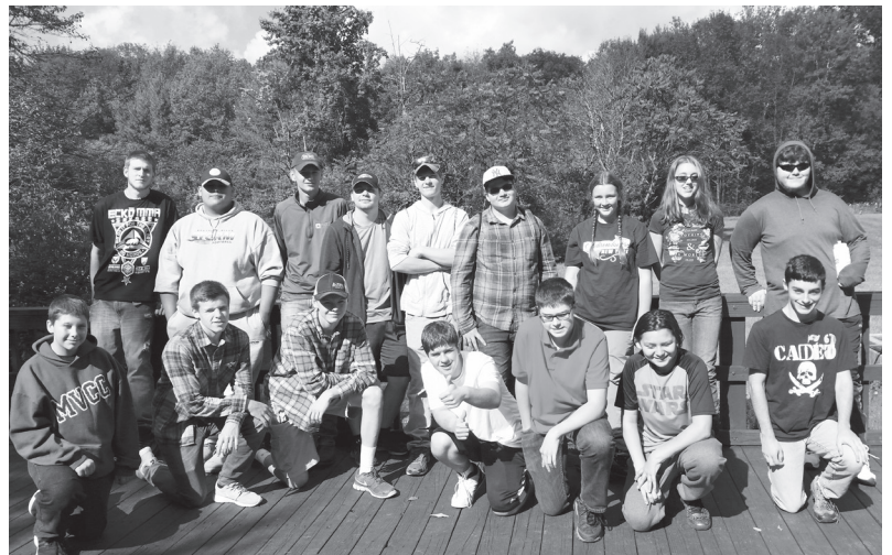
Outdoor Education Club members who attended this year's field experience.

On Thursday October 5th the Outdoor Education Club, which is comprised of students of the Jr/Sr High School and BOCES classrooms, visited the Salmon River Fish Hatchery for a science and career exploration field experience.