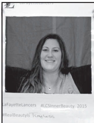
LaFayetteLancers #LCSinnerBeauty 2015 #RealBeautyIs Teen Institute