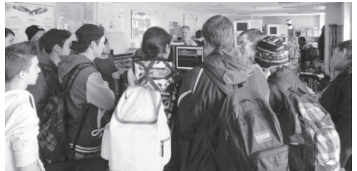
Seniors in the College of Engineering and Computer Science discuss their project with LaFayette students. The project combines concepts in electrical engineering and computer programming.

For those who want to learn more about engineering, Syracuse University's College of Engineering and Computer Science will be hosting an Open House on Saturday, April 18th, for prospective students. The event is free; however, registration is required. Registration can be completed online at http://ecs.syr.edu/openhouse .