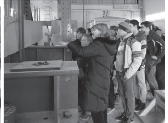
Students examine a concrete beam that was analyzed and tested by Syracuse University Civil Engineering students.

Students then visited the College of Engineering and Computer Science's lab spaces where they met with students and faculty actively engaged in designs and projects. In the Electrical Engineering department our students met with SU students working on their senior design projects. Our students walked through the lab and talked with the seniors about their projects. They saw evidence of teamwork, independent learning, and problem solving. In the Civil Engineering department our students walked through the concrete lab and observed a full-scale concrete beam that had been tested to the point of failure. In the materials lab several Mechanical Engineering students showed our students how they take their ideas and concepts from the computer to real life with