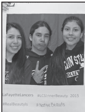
LaFayetteLancers #LCSinnerBeauty 2015 #RealBeautyIs #NativeBeautis