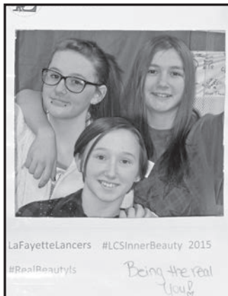
LaFayetteLancers #LCSinnerBeauty 2015 #RealBeautyIs Being the real you!