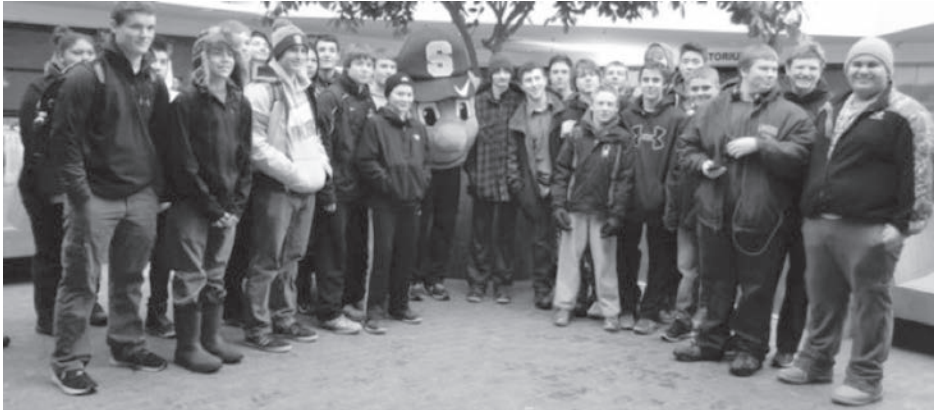
Project Lead the Way students meet Otto the Orange at Syracuse University

The Project Lead the Way (PLTW) classes were provided the opportunity to visit Syracuse University's College of Engineering and Computer Science on February 24th. The purpose of the visit was to continue an ongoing theme of teaching the students what engineering is and how to become an engineer. By visiting the college the students had the chance to see what the next step is on the engineering career path and gained an understanding of what engineering looks like on the collegiate level.