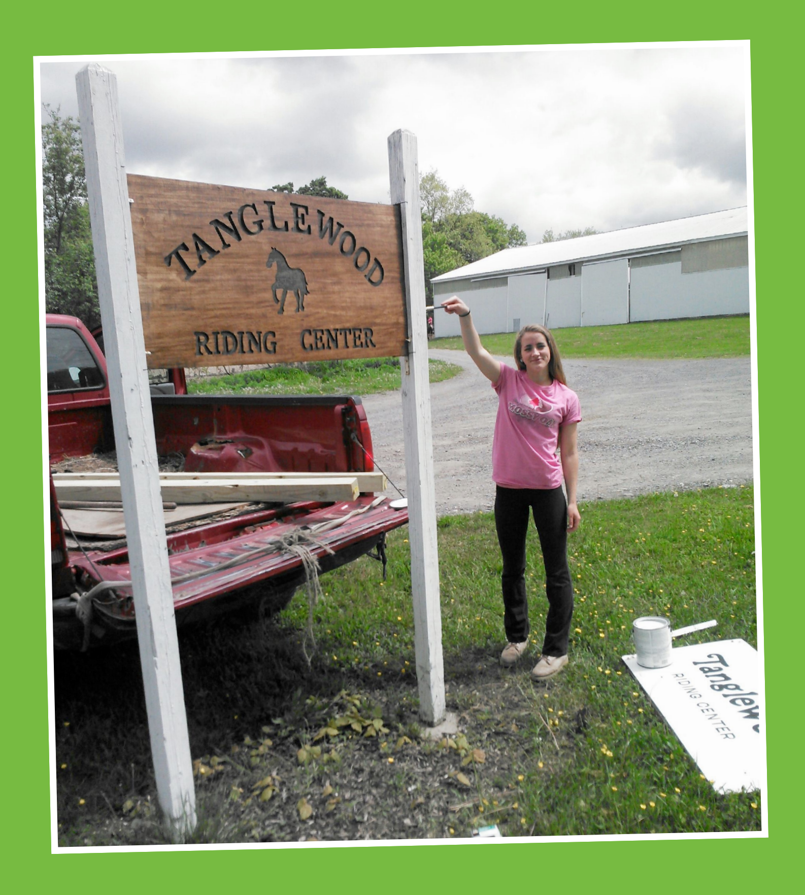
LaFayette Big Picture School Student Application