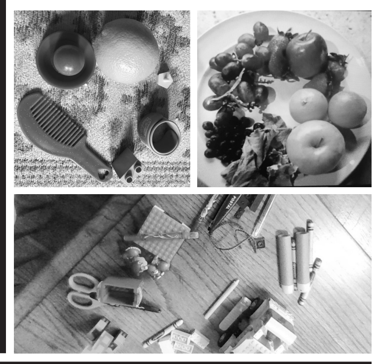
Visit our website for more information

Color Wheel Challenge ...third grade class at Grimshaw arranged objects found in their homes to correspond to the color wheel and uploaded photos to Google Classroom.