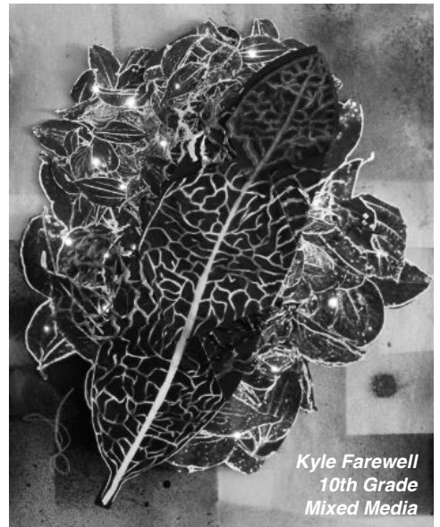
Kyle Farewell 10th Grade Mixed Media