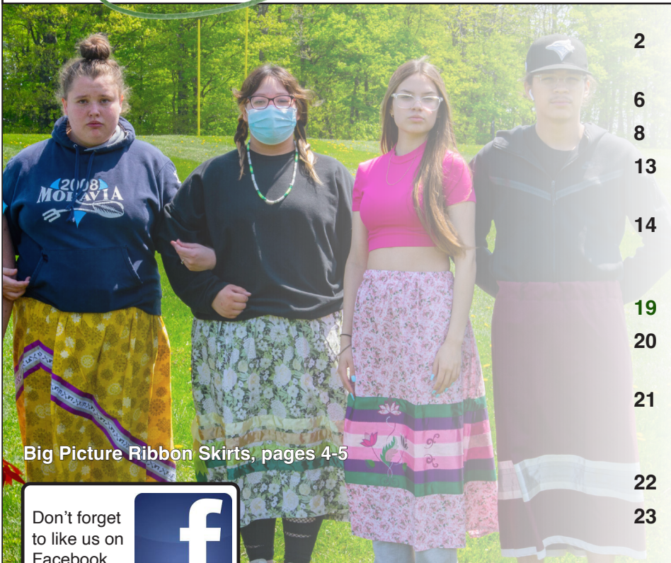
Big Picture Ribbon Skirts, pages 4-5