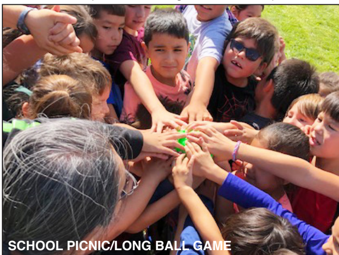
SCHOOL PICNIC/LONG BALL GAME

Our school year is off to a great start. In September ONS hosted a community/school picnic and long ball game. Kids, parents and teachers enjoyed the games, food and each others' company. We had a great turn out! Many thanks to the ONE scholarship for providing the hotdogs, buns