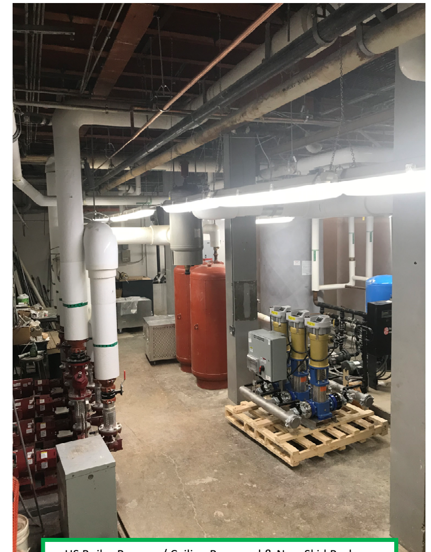
HS Boiler Room w/ Ceiling Removed & New Skid Package